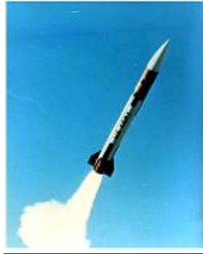
Figure 1 Patriot missile

should aim next, it calculates the velocity of the Scud and the last time the radar detected the Scud. Time is saved in a register that has 24 bits length. Since the internal clock of the system is measured for every one-tenth of a second, 1/10 is expressed in a 24 bit-register as 0.00011001100110011001100. However, this is not an exact representation. In fact, it would need infinite numbers of bits to represent 1/10 exactly. So, the error in the representation in decimal format is